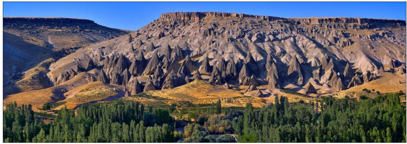
Selime, vallée d'Ihlara, Cappadoce

E-mail: tanatolia@terra-anatolia.com - Website: www.terra-anatolia.com